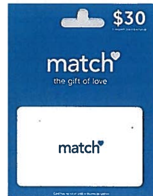
Consumers can buy Match.com gift cards at local retailers using the payment form they want

This can all be done without any involvement of the Apple and Google stores, so the argument that there is a "monopoly" on payments is false.